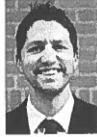
Sen. Paul Boyer (R)