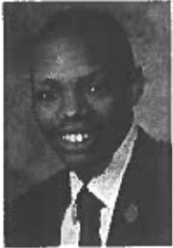
Rep. Reginald Bolding (D)