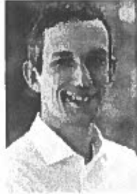
Sen. Sean Bowie (D)