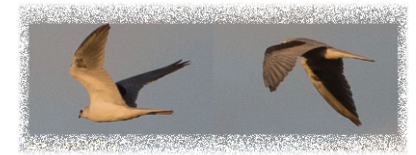
White-tailed Kite in Duncan