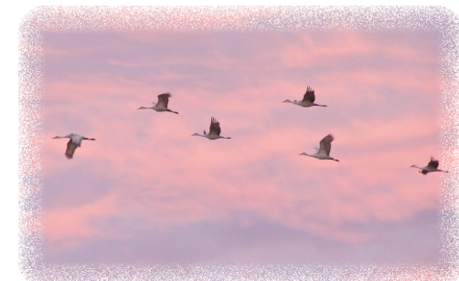
Sandhill Cranes, Duncan Birding Trail

Questions/Changes/Additions? Please write to innkeeper@simpsonhotel.com